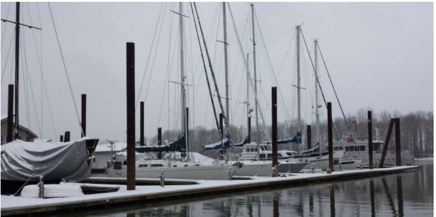
of the St Helens Marina