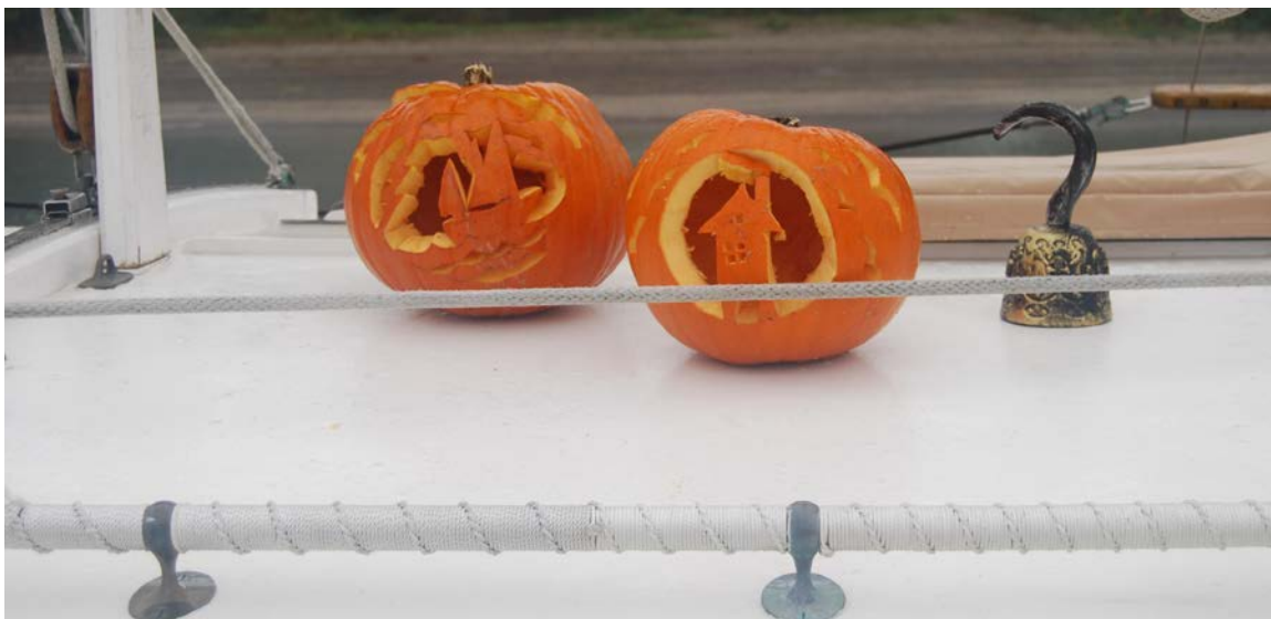
S/V Rowena , her jack-o-lanterns and her Pirate Captain's hook.

http://www.owsa.net/ SIYC women – If an emergency arose while you were out cruising, could you take over from your partner? If not, this is the one for you: Oregon Women's Sailing Association . This local organization offers sailing classes (including cruising skills) especially for (and sometimes exclusively for) women.