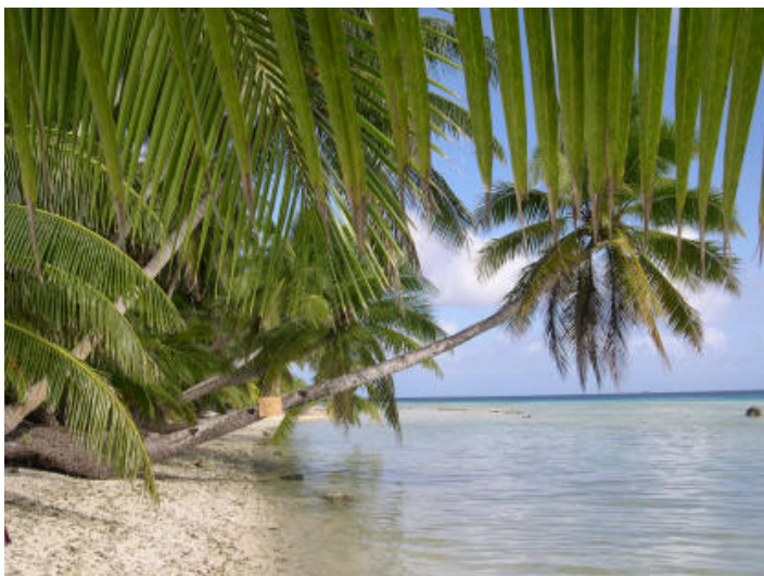
Suwarow Island, 2003, S/V Sequoia