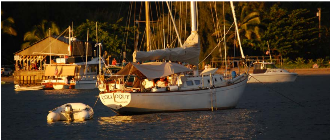
Basking in the setting sun, Hanalei Bay, Kauai, July 2011.

Other cruising members out there – let's hear from you in the coming months – your reports of your adventures are the heart and soul of the club and we want to know what it's like!